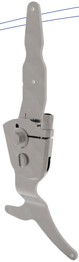
Model 3A75 Triple Action® Ankle Joint With Tapped Swept Stirrup